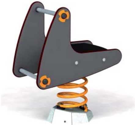
121 431 Bob Grey, sunken foundation 121 431OM Bob Grey, above ground