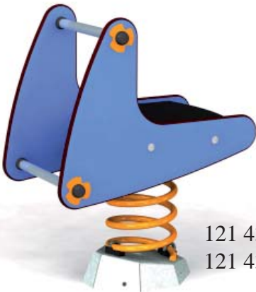
121 432 Bob Blue, sunken foundation 121 432OM Bob Blue, above ground