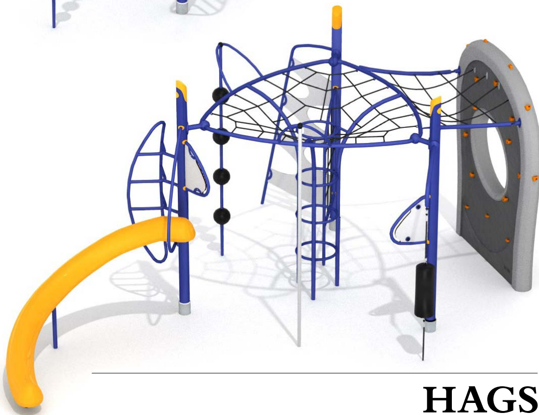
SYRO 144 521