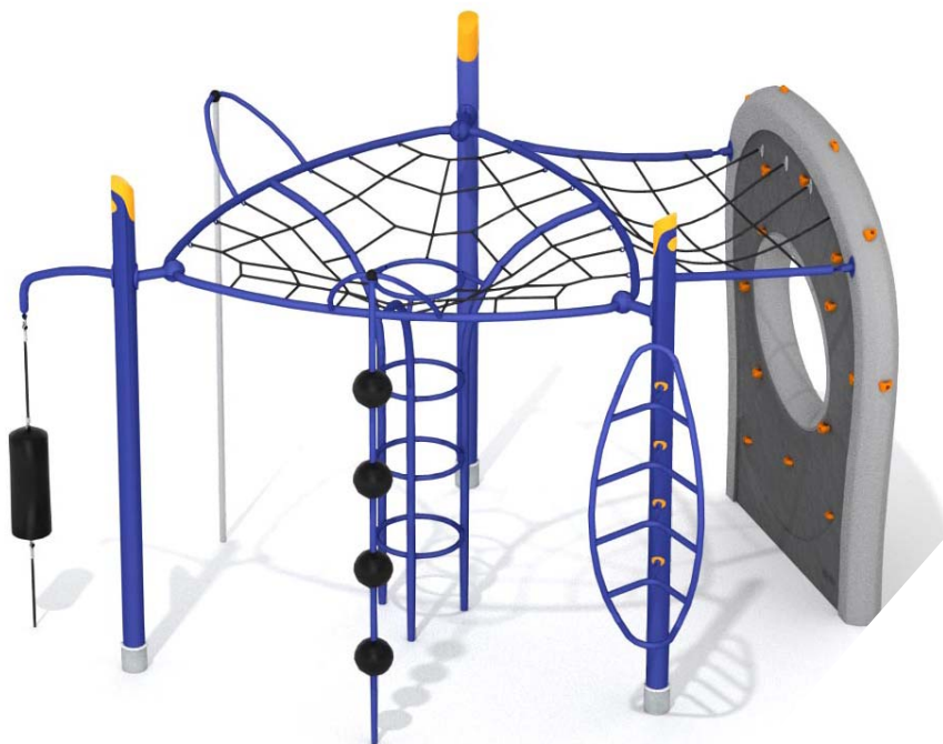
CEDRUS 144 522